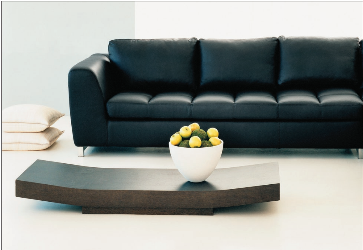
Lennon's unique shape and sleek, low profile are sure to make it an object of envy.

Maurice Villency furniture is renowned for its striking design sensibility, unparalleled attention to detail, and legacy of European craftsmanship. We offer a uniquely tailored experience including complimentary interior design services. Each piece in our collection is available in a wide array of fabrics and finishes, and may be customized to fit seamlessly into your home.